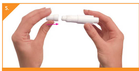
Now replace the mouthpiece by screwing it back into place.