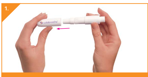
Remove the cap. It comes away with a gentle pull.