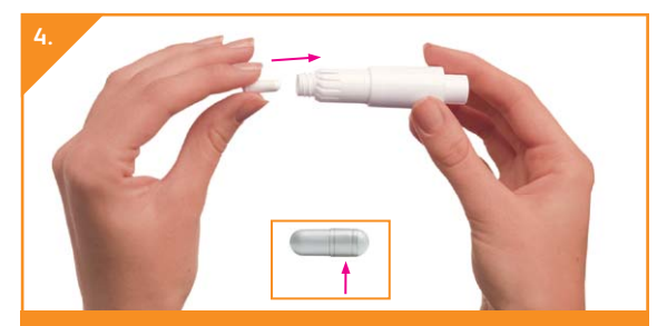
Gently insert the capsule into the chamber with the widest end first. No force is required.